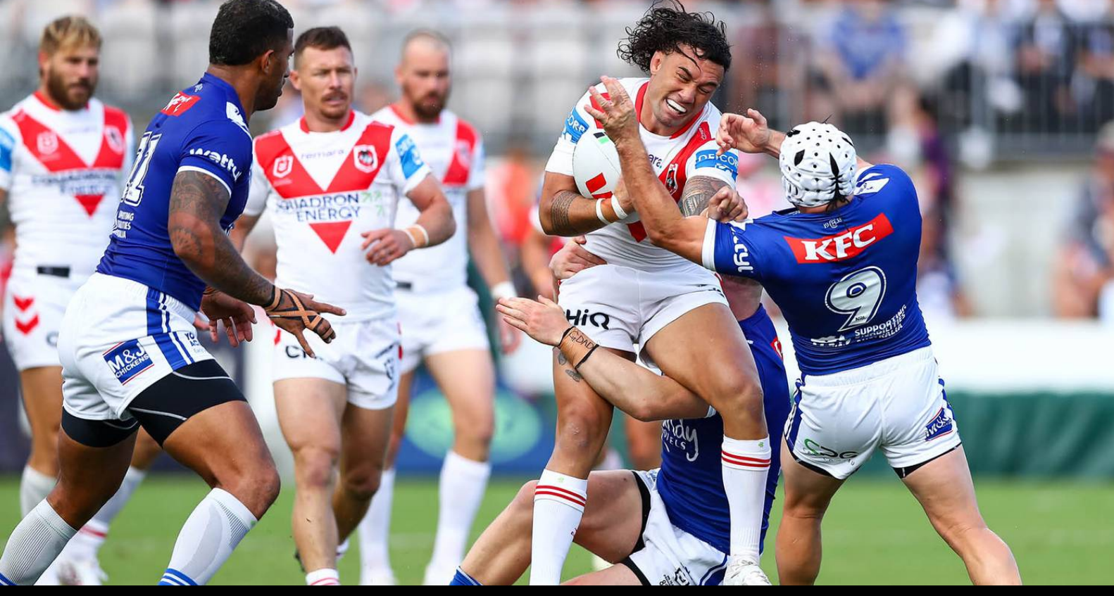
18-DAY CRUISE PACKAGE | RUGBY LEAGUE VEGAS, JAMAICA & MEXICO