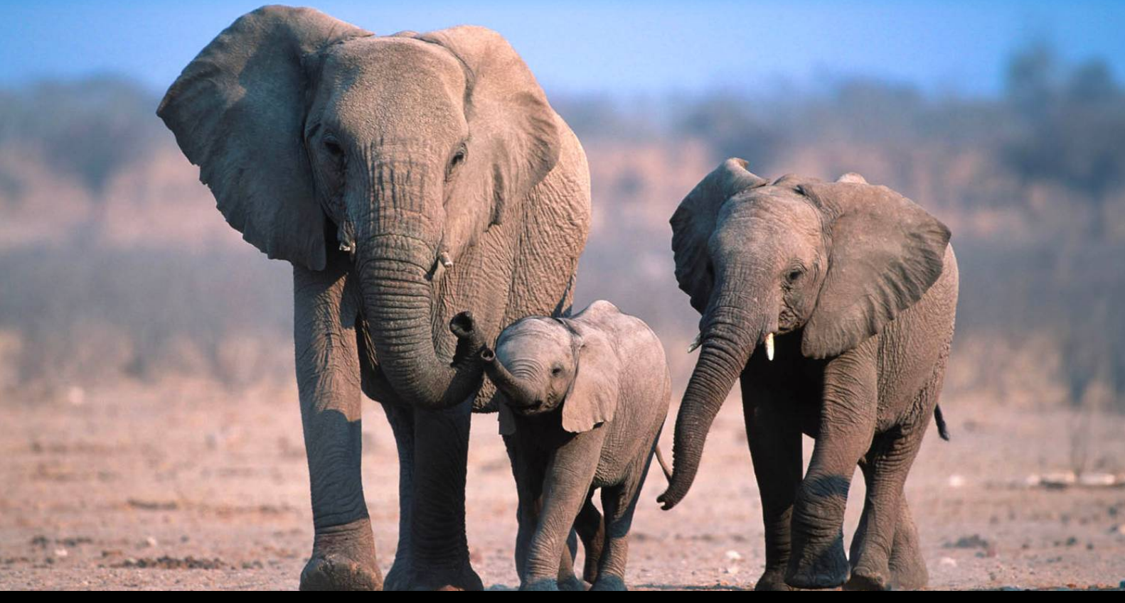
10-DAY TOUR PACKAGE | HIGHLIGHTS OF SOUTH AFRICA FOR 2