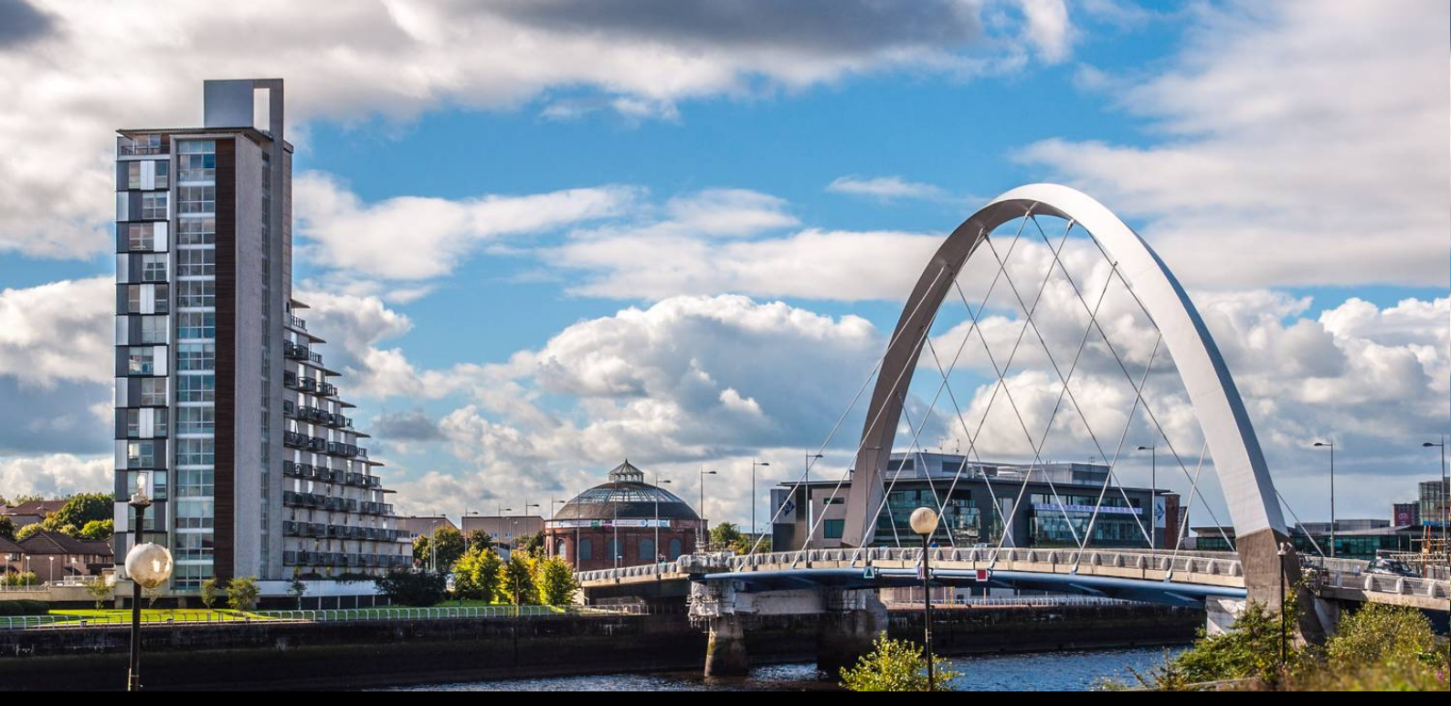
14-DAY TOUR PACKAGE | HIGHLIGHTS OF THE BRITISH ISLES FOR 2