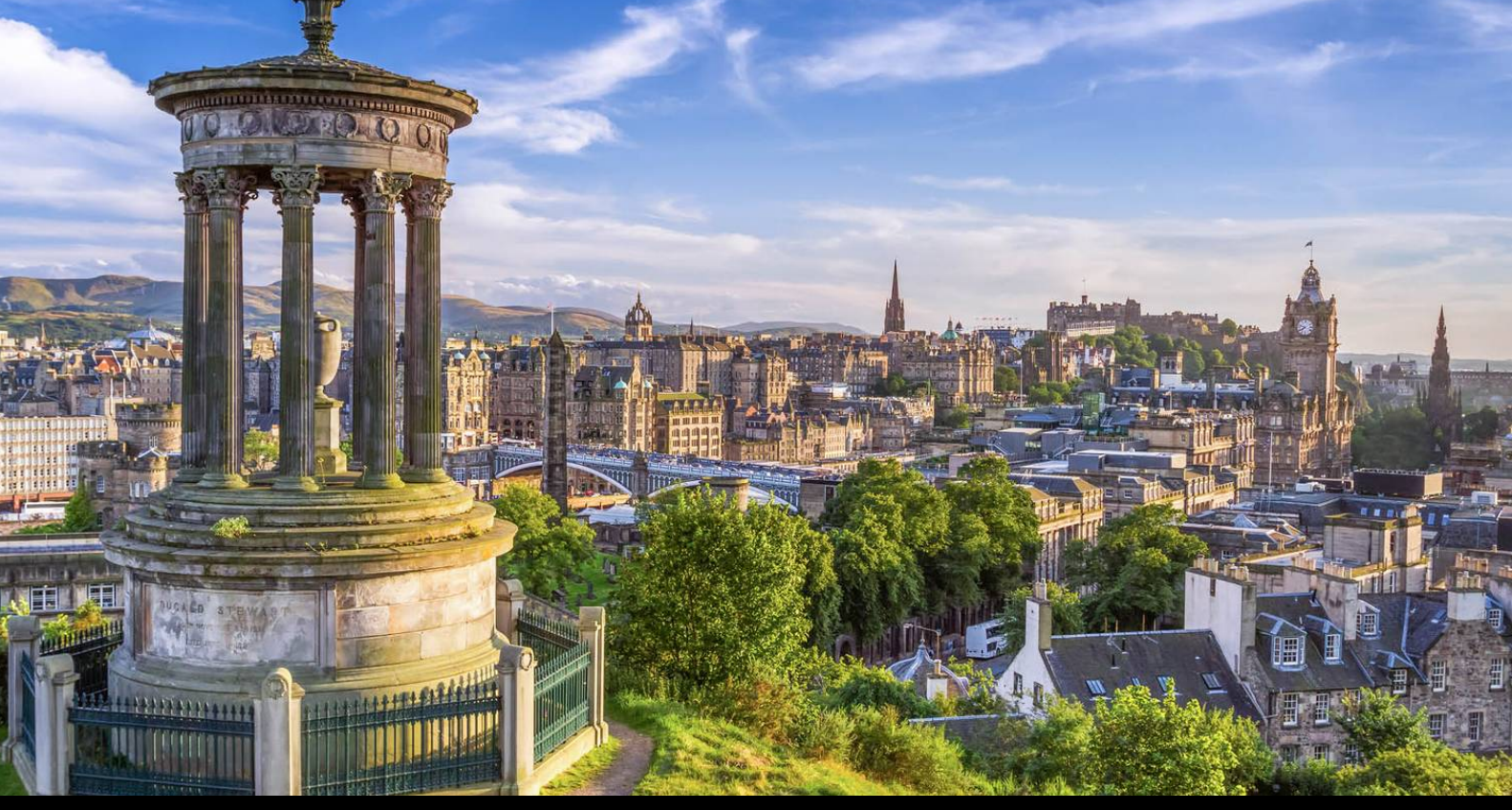
14-DAY TOUR PACKAGE | HIGHLIGHTS OF THE BRITISH ISLES FOR 2