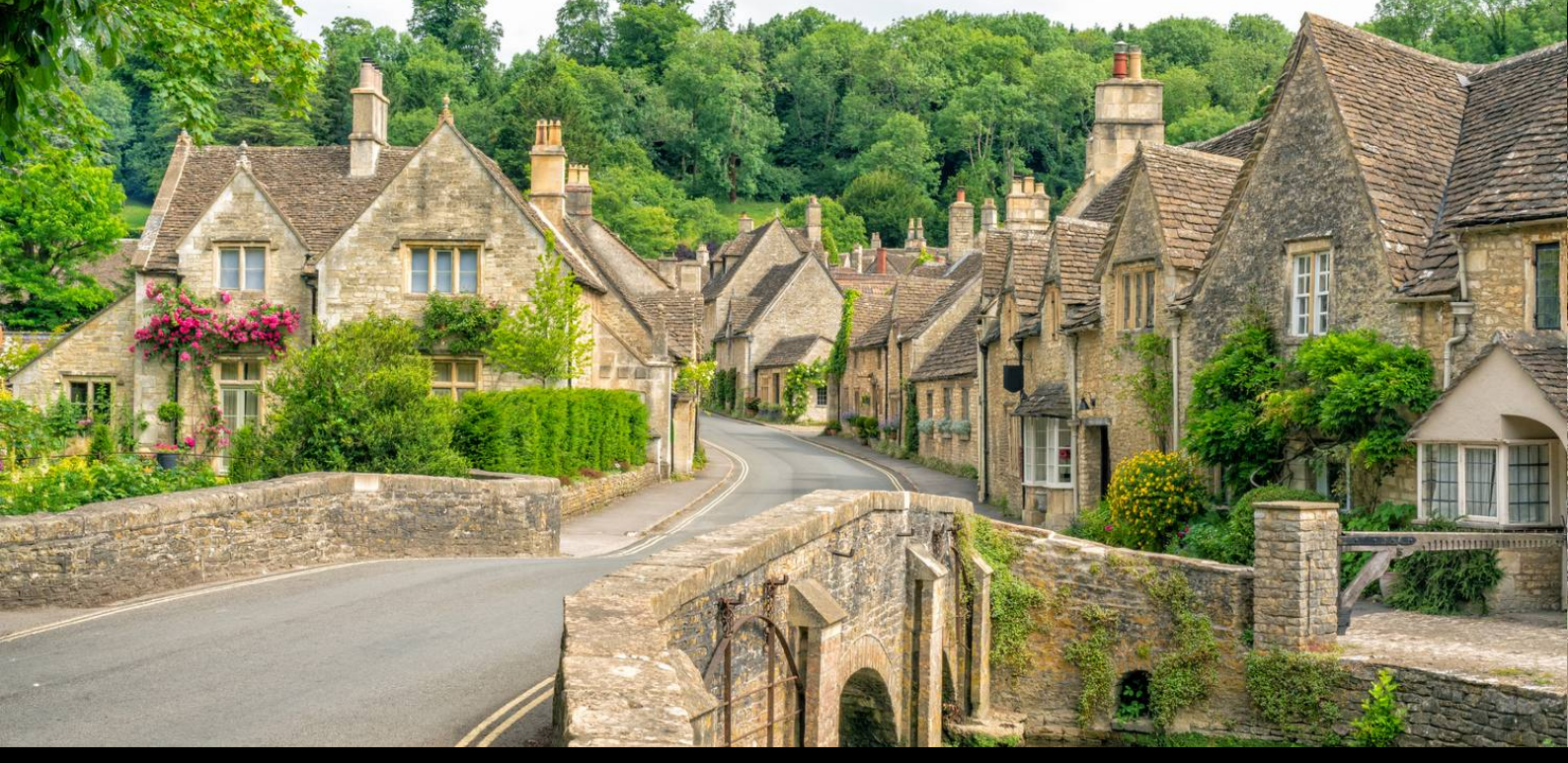
14-DAY TOUR PACKAGE | HIGHLIGHTS OF THE BRITISH ISLES FOR 2