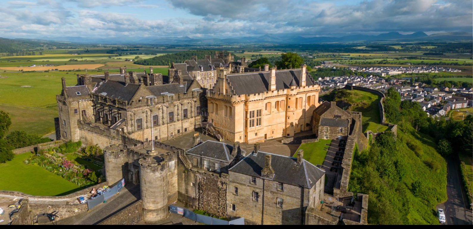
14-DAY TOUR PACKAGE | HIGHLIGHTS OF THE BRITISH ISLES FOR 2