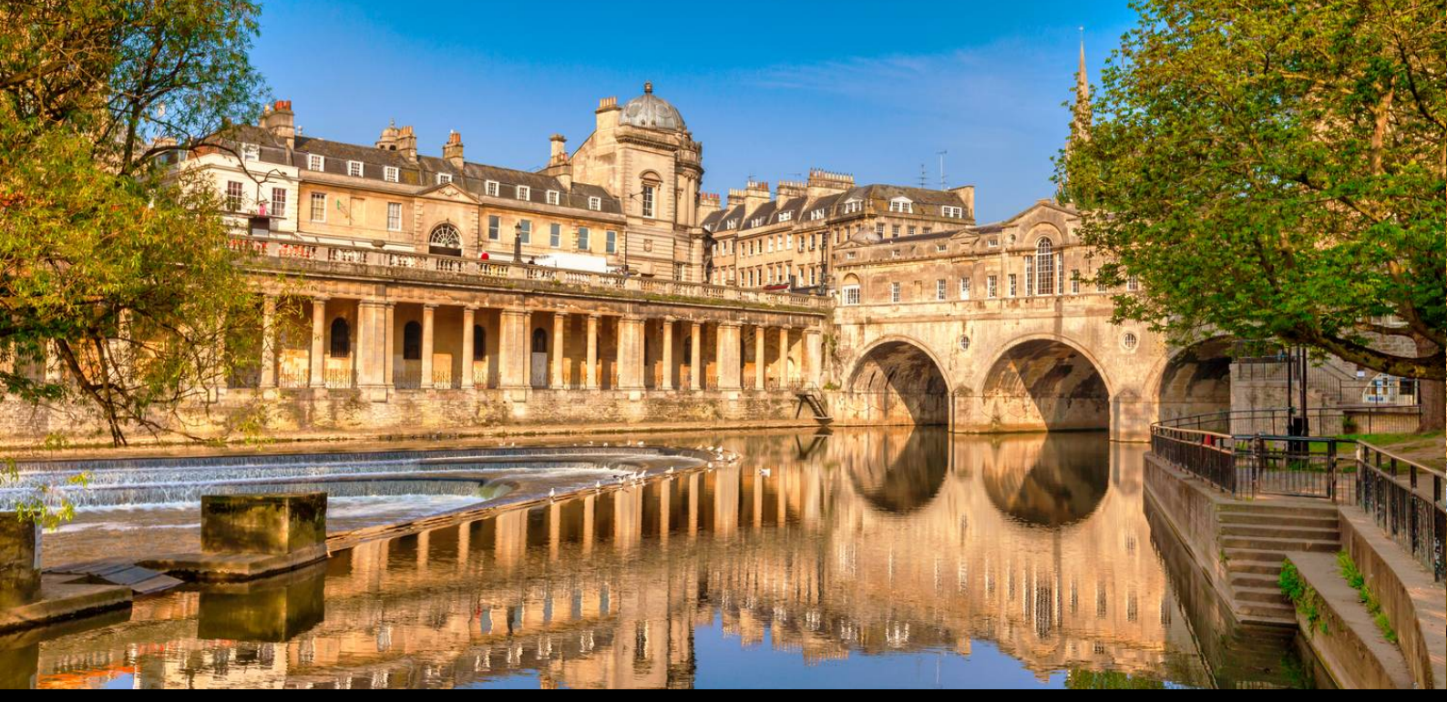
14-DAY TOUR PACKAGE | HIGHLIGHTS OF THE BRITISH ISLES FOR 2