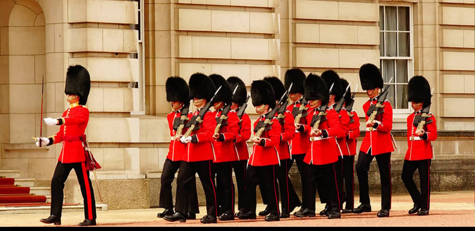
14-DAY TOUR PACKAGE | HIGHLIGHTS OF THE BRITISH ISLES FOR 2