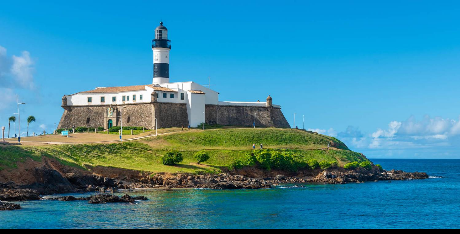
28-DAY CRUISE PACKAGE | BARBADOS, BRAZIL & ARGENTINA VOYAGE