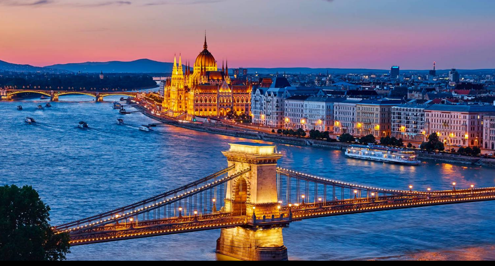
30-DAY TOUR PACKAGE | GRAND EUROPE