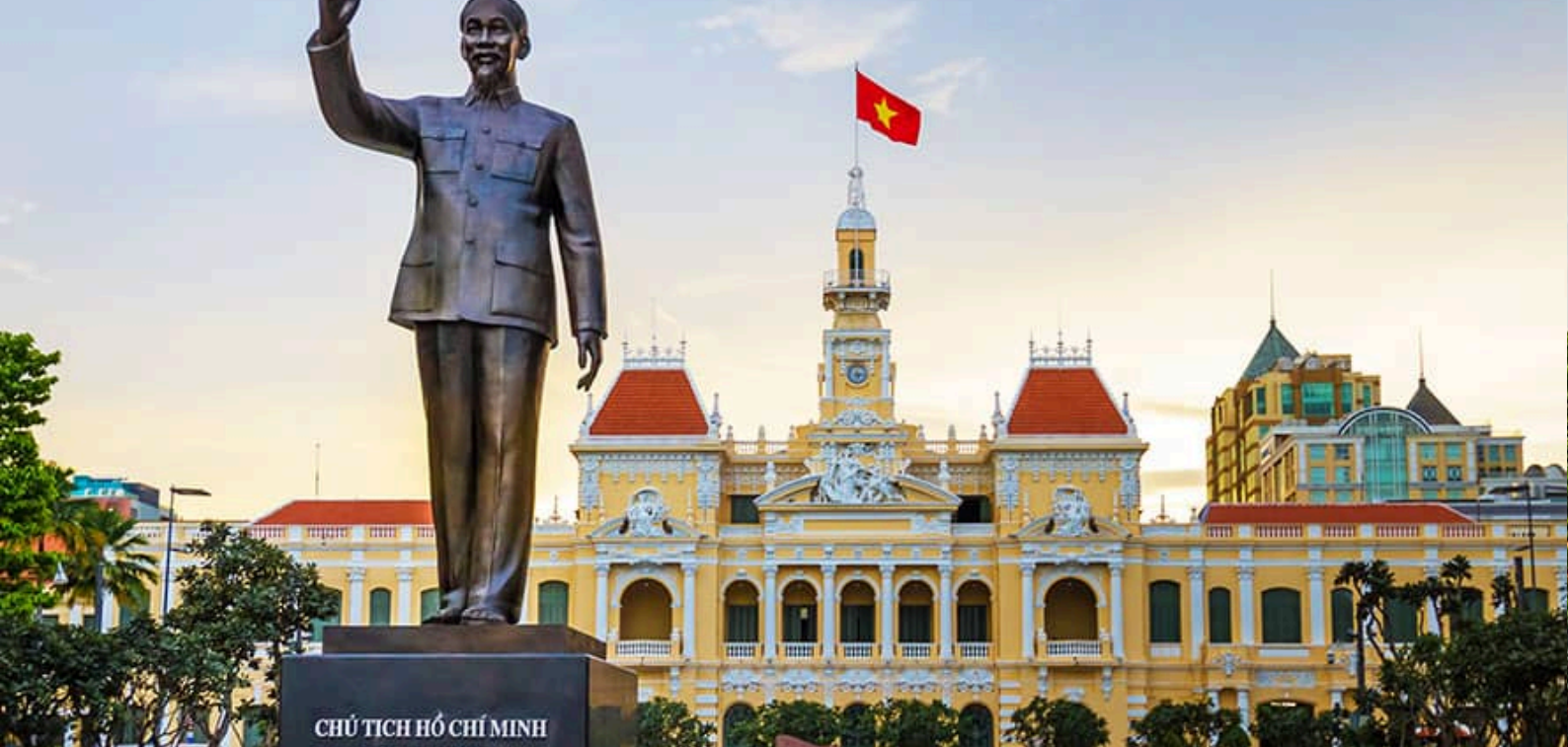
CHỦ TỊCH HỒ CHÍ MINH