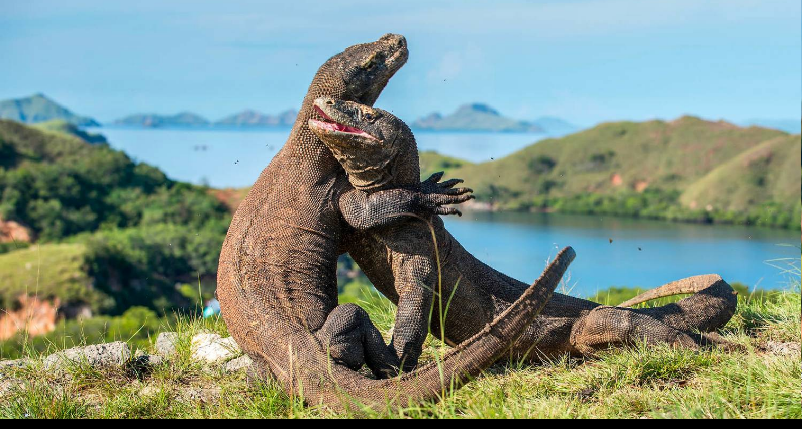
12-DAY TOUR PACKAGE | INDONESIA'S KOMODO & FLORES ISLANDS