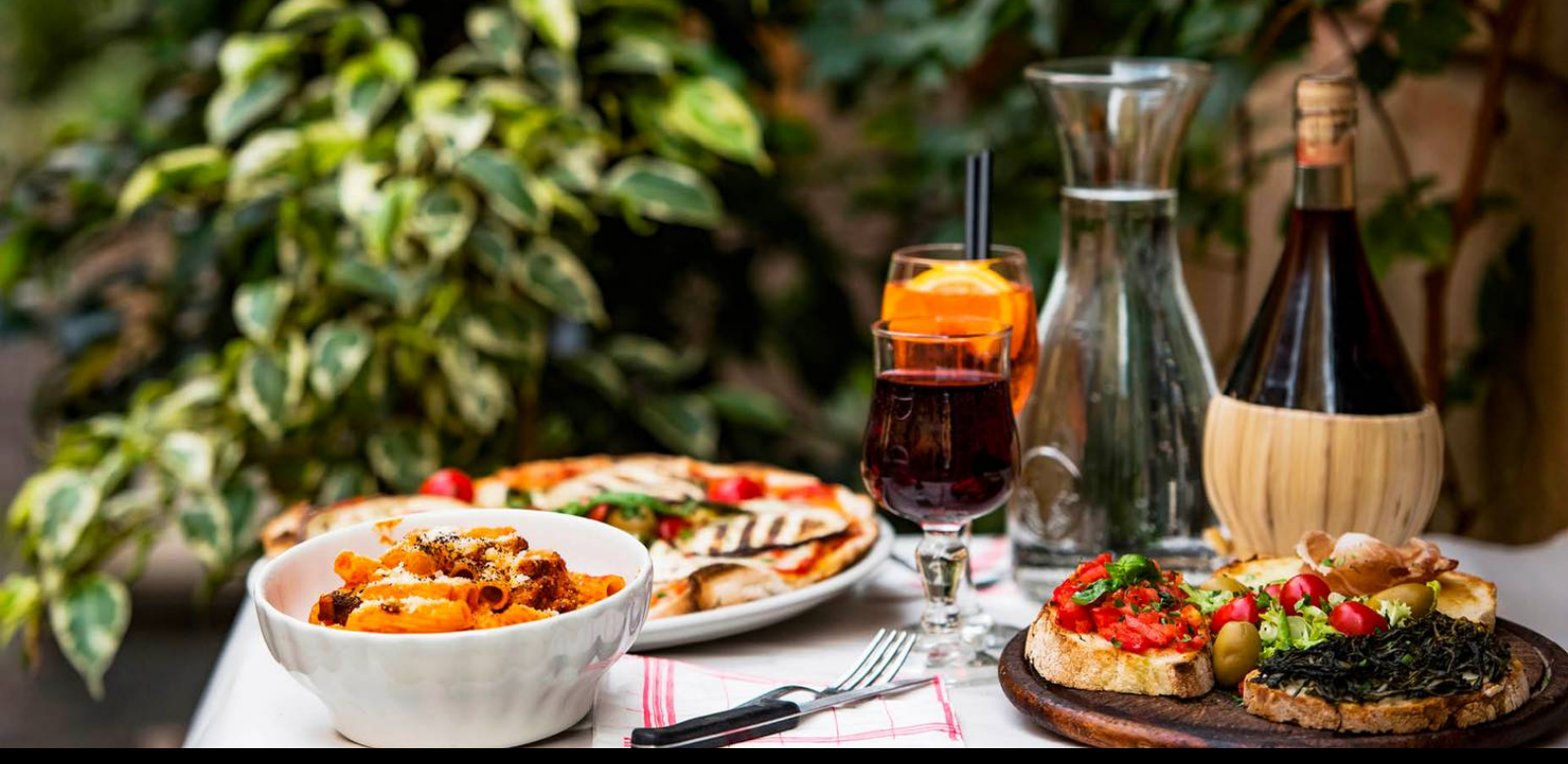
16-DAY TOUR PACKAGE | ITALIAN FOOD & WINE